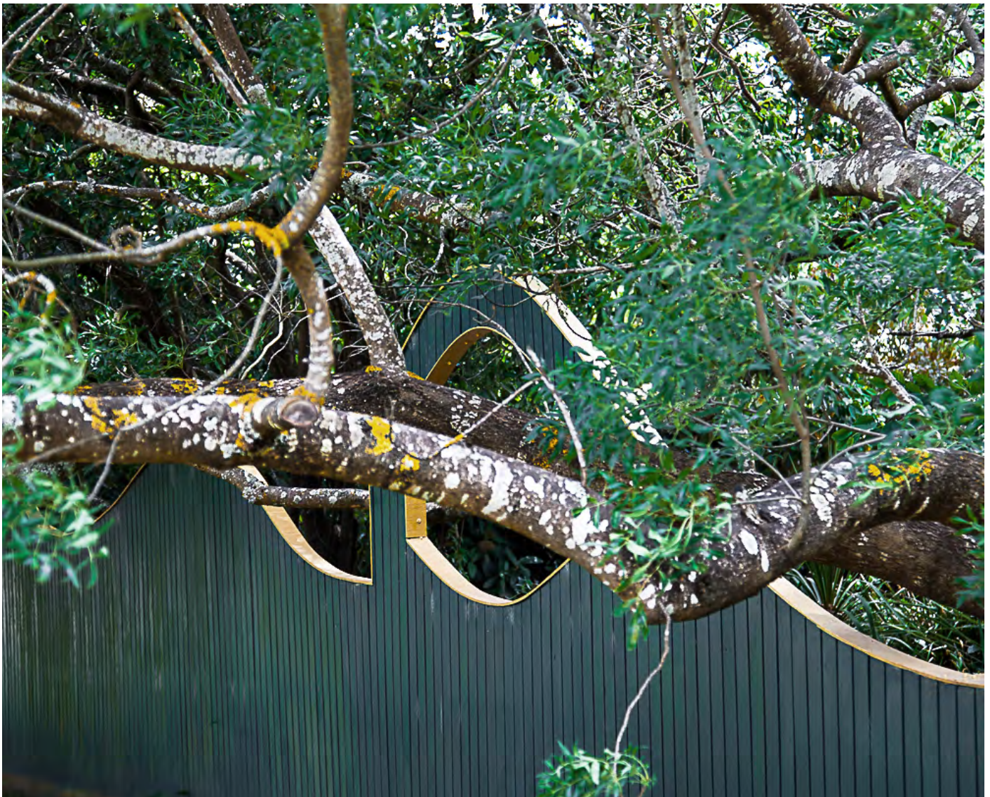
① Working with constraints – such as the need to accommodate the branches of this tree – can lead to imaginative fencing designs. The capping on this fence will help strengthen it and keep moisture out of the ends of the timber palings, prolonging its life.

Recycled plastic and wood-plastic composites (WPCs) are becoming more readily available for a variety of external applications including fencing and decking. They have the twin advantages of giving another life to waste products and being considerably more durable than plain wood; WPCs have a look and feel closer to that of timber than plastic-only products. They can both be cut, drilled and planed just like timber, don't crack or splinter,